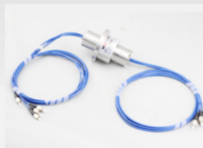
FB06 series Slip Rings

FB06 slip rings are standard, off-the-shelf. It could support 6 channel fiber optics(SM/MM) transmitting on 360° rotating. Single-channel (SM or MM) rotary joints (FORJ) are the most versatile designs the market has ever seen. The rugged body allows fiber pigtail, ST, or FC receptacles on either the rotor side or the stator side. One can configure the package to fit his need exactly. features extremely low insertion loss and impressive return loss performance for both singlemode and multimode fibers.