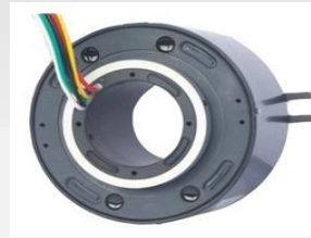
TB100185 Slip Rings

Continuous transmission of power and/or signal under 360° unrestrained rotation. Applies advanced fiber brush technology, free of maintenance or lubricating oil. Multi contact points in each circuit, low contact pressure, low noise, low contact wear; extremely long life-time. Standardized & modularized design; customized solutions also available.